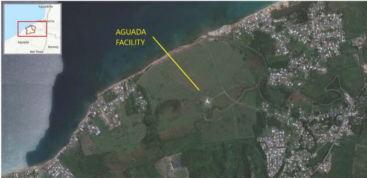
LOCATION MAP: Aguada Facility